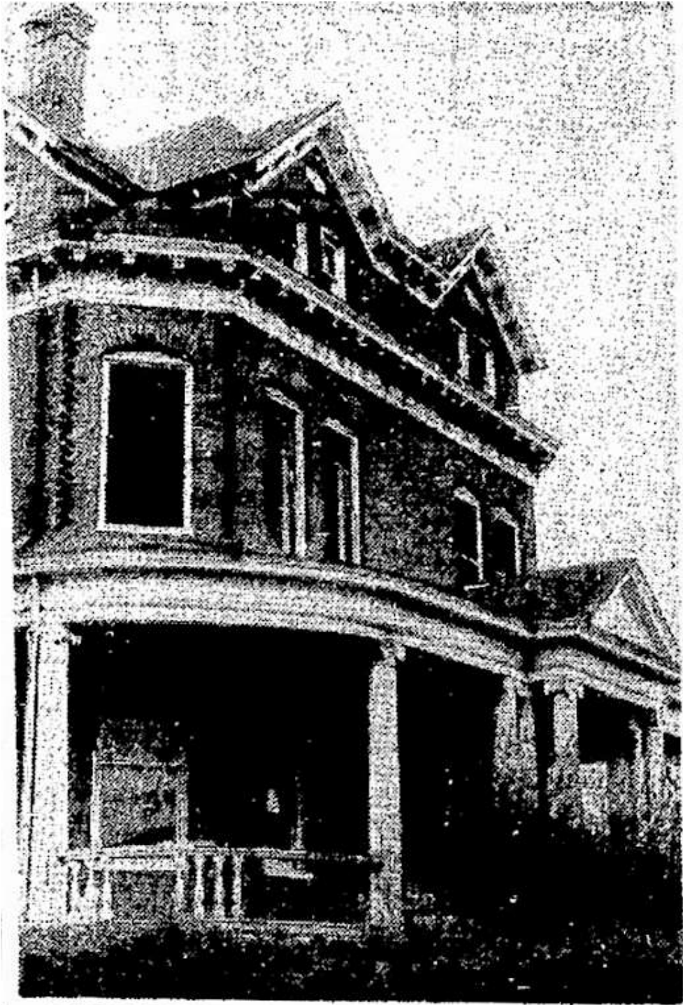
FADED BEAUTY —Vacant resident at 179 W. Main St., was damaged by fire yesterday as coals from fireplace burned through first floor. Occupied at times by prominent Danville families, the once-handsome building is now being razed.